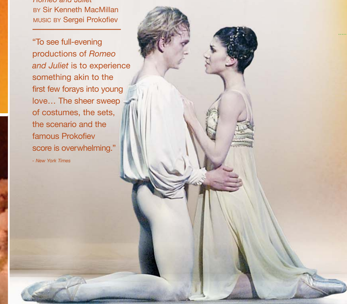
David Hallberg and Paloma Herrera in ABT's Romeo and Juliet.

"To see full-evening productions of Romeo and Juliet is to experience something akin to the first few forays into young love... The sheer sweep of costumes, the sets, the scenario and the famous Prokofiev score is overwhelming." - New York Times